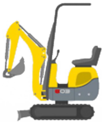
Compact excavator 803